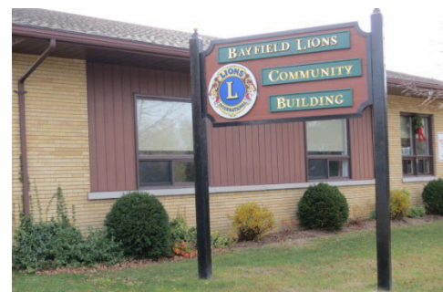
Bayfield Lions Community Building

To Book: Go to bayfieldlions.ca/room-rentals/