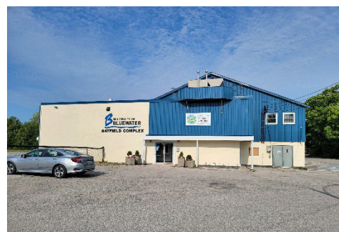
Bayfield Arena and Community Centre

To Book: Contact Bayfield Community Centre— 519-565-2121 or email info@bayfieldcommunitycentre.ca