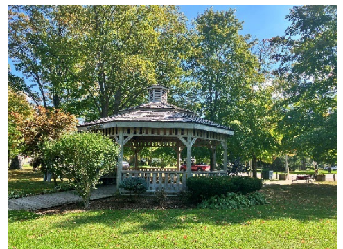
Clan Gregor Square Gazebo