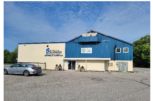
Bayfield Arena and Community Centre

To Book: Contact Bayfield Community Centre— 519-565-2121 or email info@bayfieldcommunitycentre.ca