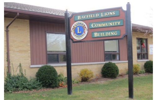
Bayfield Lions Community Building

To Book: Go to bayfieldlions.ca/room-rentals/