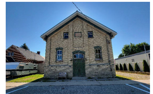
Hay Town Hall