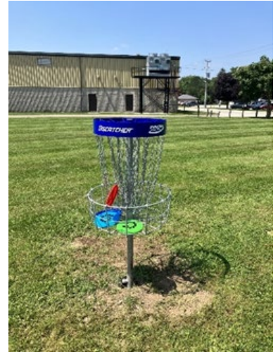
Disc Golf Course at Hensall Arena