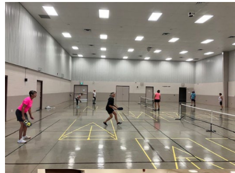
Drop-in Pickleball in Zurich

If you check out "Object Library" under "Collections" on our website, you can see all the things in the Object Library patrons can borrow! There are other fun things like ukuleles and telescopes. Go to the website for more information www.huroncountylibrary.ca .