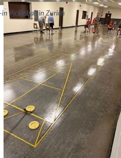
Drop-in Shuffleboard in Hensall