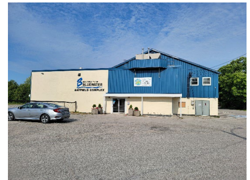
Bayfield Arena and Community Centre

To Book: Contact Bayfield Community Centre— 519.565.2121 or email info@bayfieldcommunitycentre.ca